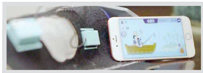
Fun Knee introduces an element of fun in patients' rehabilitation through gamification using mobile phones.

introduces an element of fun into their rehabilitation programme. Leveraging motion sensor technology, this award-winning innovation enhances the thrill and excitement of these games, while performing foundational movements for TKR rehabilitation.